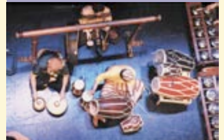
West Javanese Gamelan