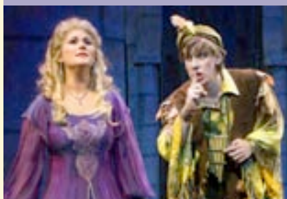
The Magic Flute