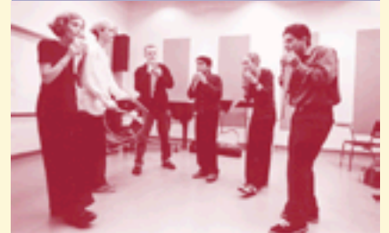
Latin American Ensemble