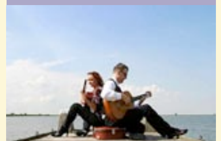
Z.o.o. Guitar Duo