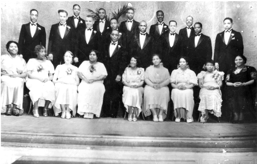
Figure 2. The Keeton chorus in 1936.

Keeton's programming was typical of his later concerts: spirituals (ar-